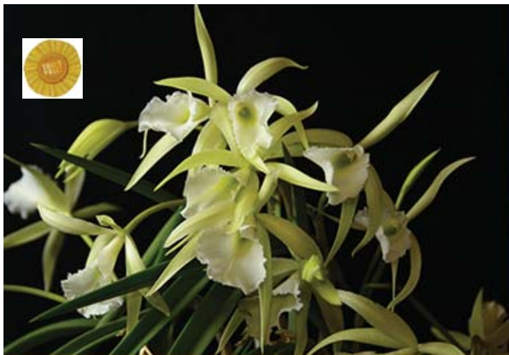
B. Jimminey Cricket