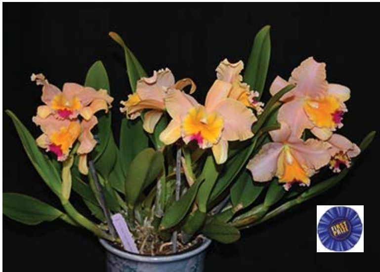
Pot. Island Peach 'Valley Isle'

Unfortunately, the calcium and magnesium are not very soluble when found in these forms and are not easily absorbed by your plants. The better way to supply these minerals is to use Epsom salts dissolved in water to deliver the magnesium to your plants. Then dissolve calcium nitrate in water to get the calcium and nitrogen supplied to the plant. The problem arises when the Epsom salts and the calcium nitrate are used together. When calcium and magnesium are added into the water at the same time, they form a solid known as a precipitate, and this leaves a solution with no calcium or magnesium in a form that the plants can absorb. The calcium nitrate solution must be sprayed on separately, and then the Epsom salts solution should be sprayed on separately. This way the plant gets the calcium and nitrogen in one dose and then it receives the magnesium separately. The ratio to use during your watering is six parts fertilizer, three parts calcium nitrate and one part magnesium sulfate.