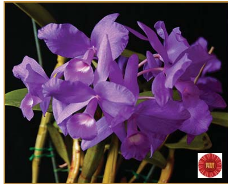
C. skinneri 'Casa Luna'