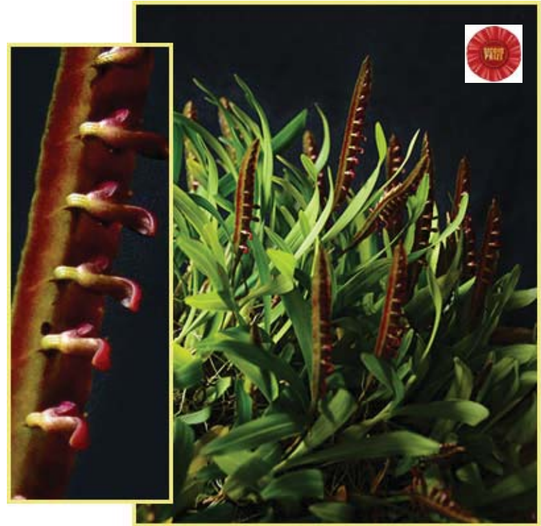
Bulb. falcatum v. velutinum

Awards, images and descriptions can be seen at http://www.csnjc.org