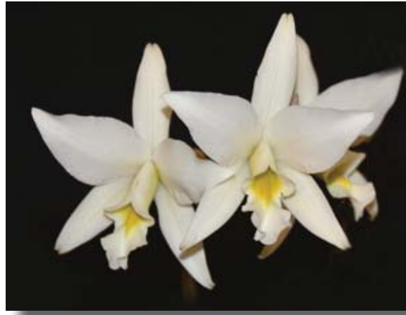
L. anceps 'Cobbledick'