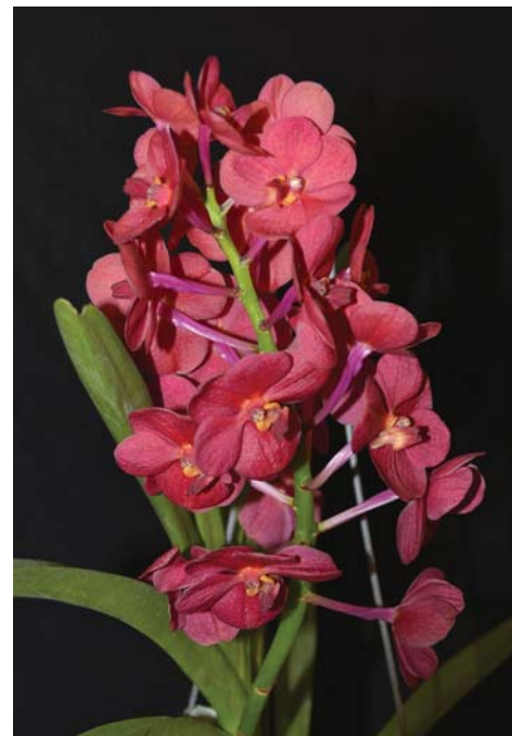
V. Fuchs Delight