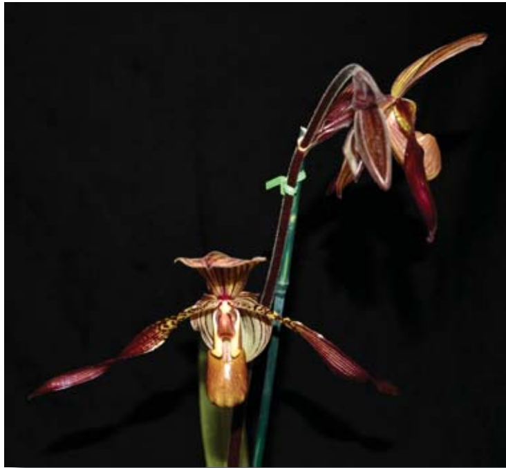
Paph. St. Low