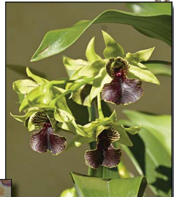
Den. Little Green Apples 'Nikki' AM/AOS