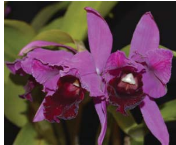
Blc. Mem. Minerva Burr 'Colossal'