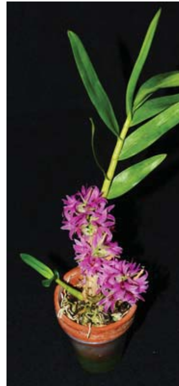
Den. bracteosum v. tanii