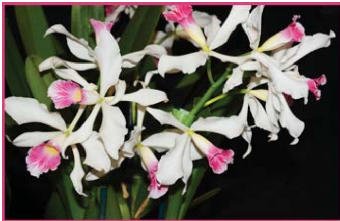
C. purpurata f. carnea