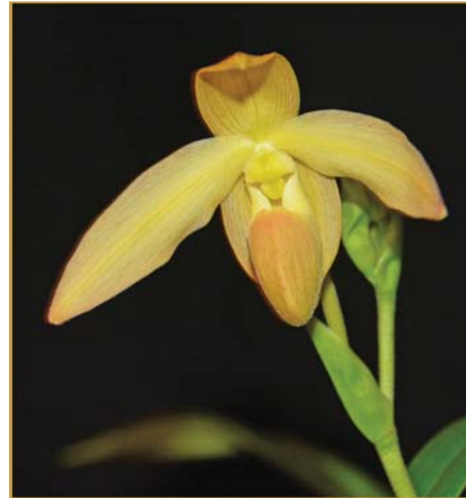
Phrag. Olaf Gruss