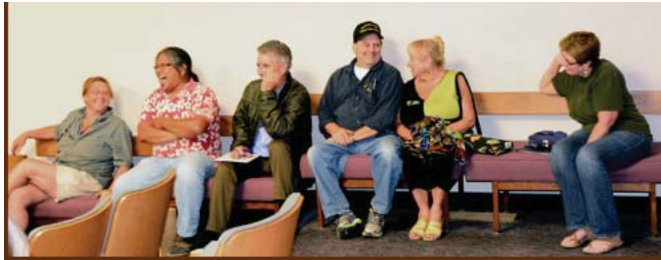
The Peanut Gallery

Aug 16: DVOS Picnic: This year's theme Hooray for Bollywood!