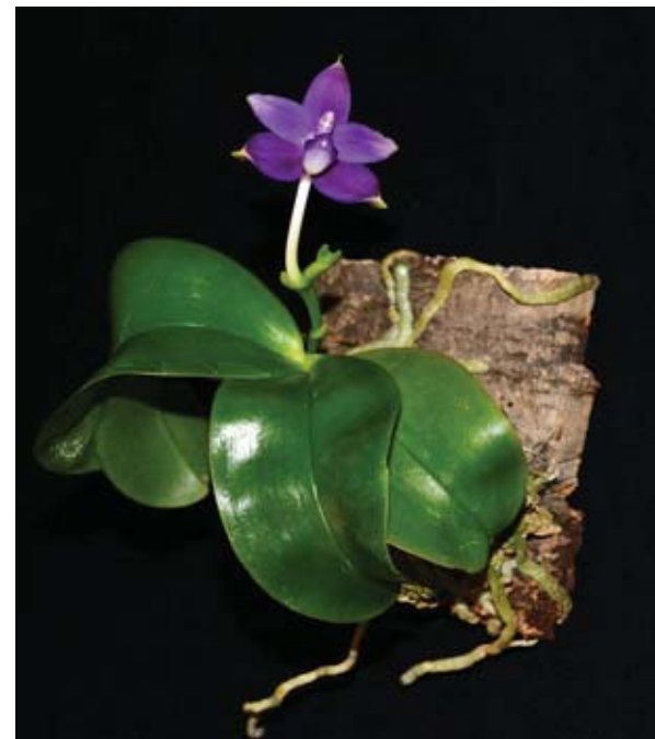
Phal. violacea v. coerulea

Last Name begins with: You bring: A - E Dessert F - I Side Dish J - Q Salad R - Z Hors d'oeuvres