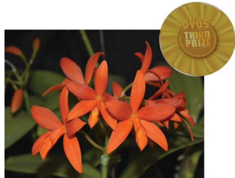
Ctt. Blazing Treat

http://www.orchidconservationcoalition.org