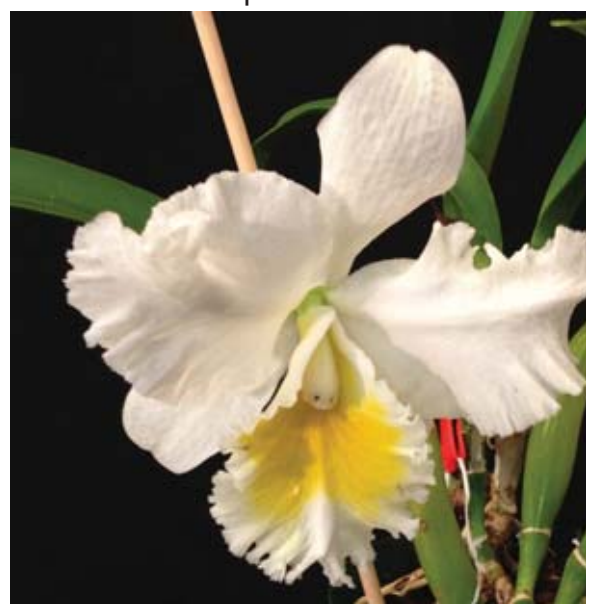
Blc. Ranger Six 'A-OK;

Help your local orchid society. For every $25 you spend, you may enter your local orchid society in a raffle for their monthly opportunity table. 30 healthy plants (some in bloom) will be award to the winning society. Winning society will be picked at the end of Sunday. The society must redeem their prize to D & D Flowers within 6 months of this sale.