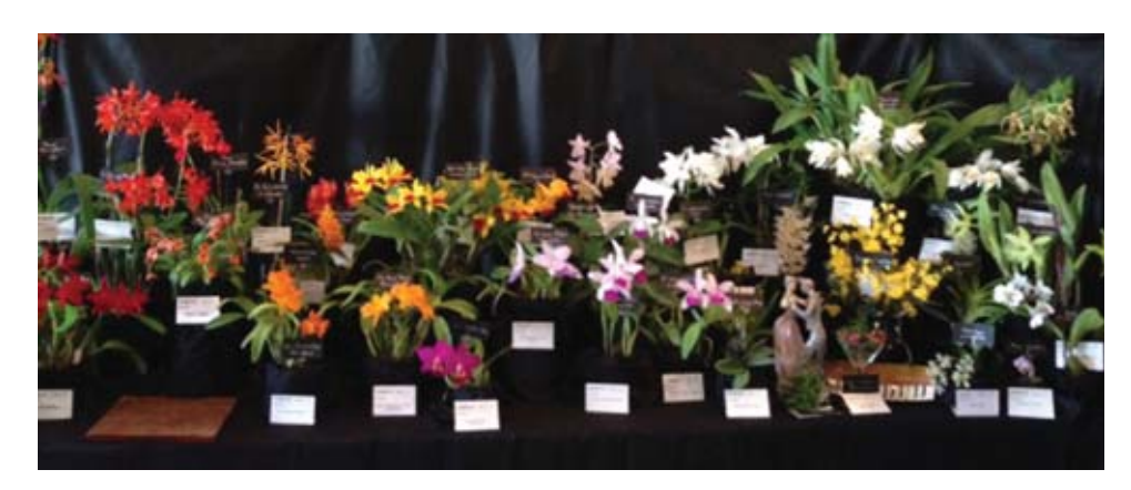
DVOS Display at SOS Show

Sichuan Fortune House, 41 Woodsworth Lane, Pleasant Hill everyone is welcome to come and meet our speaker