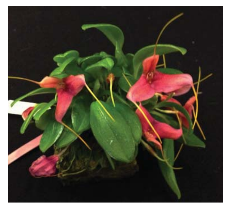
Masd. venatoria 'Brian Wraxall'