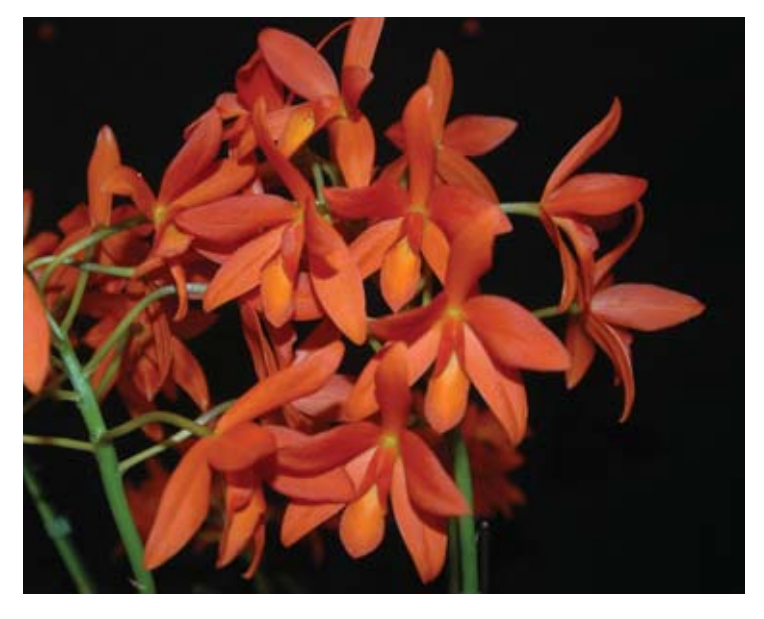
Lc. Blazing Treat