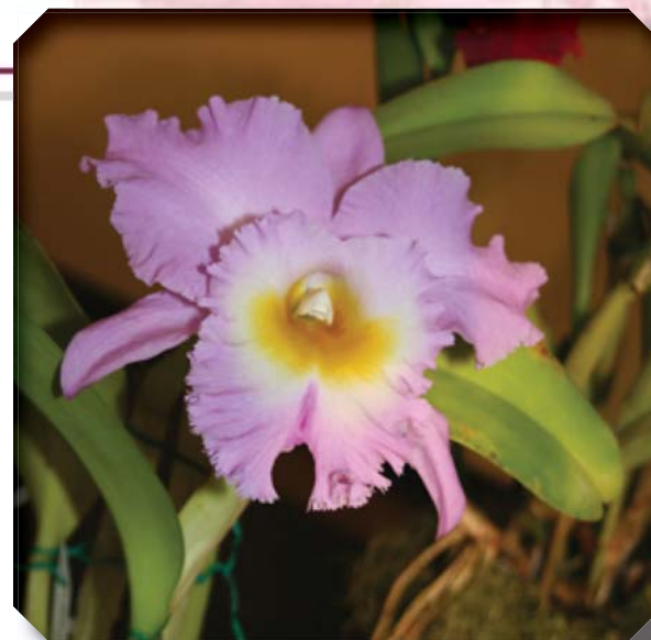
C. Mount Hood 'Orchidglade' AM/AOS