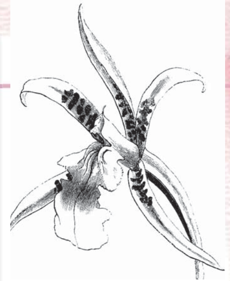
Fredclarkeara After Dark