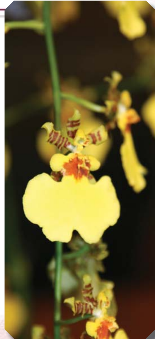
Onc. Gower Ramsey

Recently, I have joined the conservation committee at the San Francisco Orchid Society. Most societies have a clause in their mission statement about conservation and education, as does DVOS. SFOS made a decision to get a committee of members up on its feet. We had our first meeting, via Skype, on Oct. 24. Plans are afoot, including a sales table and display possible at the POE. We plan to raise funds with plant sales as an option. There is already an orchid conservation group which raises funds by a 1% of sales practice with vendors and others. But this is a bit different.