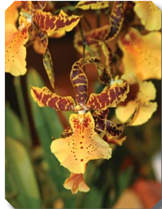
Aliceara Hilo Ablaze 'Hilo Gold' AM/AOS