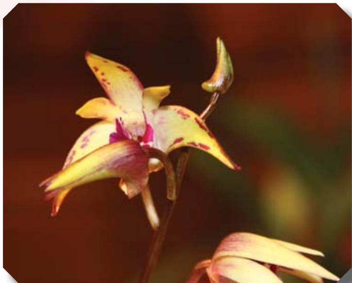
Den. (Aussie Charm x Zip) 'SVO' x Den. Cobber 'Violet Gold'