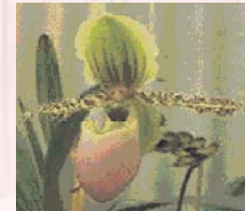
B-3 & B-9