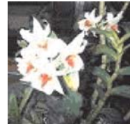
G-5 nigrohirsute dens