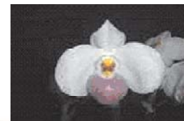
B-5 and B-15 parvisepalum paphs – like delenatii