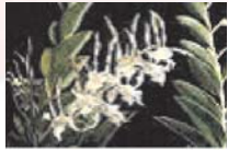
G-2: Antelope Dendrobium Notice how the petals look like an antelope's antlers.

These pictures are for the purpose of identifying your plants for the show. The list is on P. 6-8