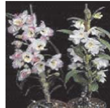
G-3 nobile dens