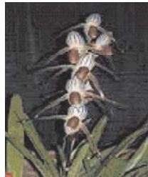
B2 and B9 multifloral paphs