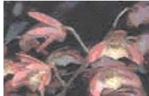
G-4: Australian dendrobiums – like kingianum