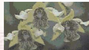
G latourea type dendrobiums