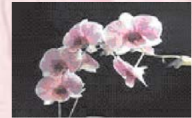
G-1 phalaenopsis-type dends.