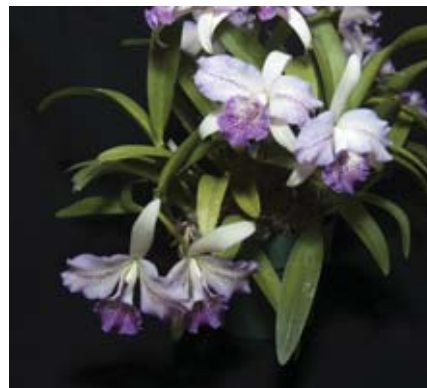
Blc. Empress Worsley