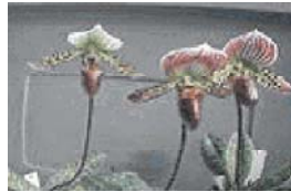
B 10 – 12 Maudiae-type paphs – the middle one is coloratum, all over deep wine purple is vinicolor