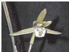
C-4 Chinese cymbidiums – like ensifolium