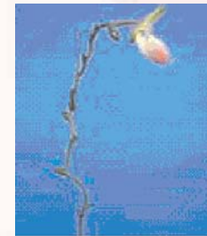
B-3 and B-9 successive or sequential bloomers – as one flowers ages another takes its place, stem only holds 1 or 2 flowers at a time unlike multiflorals