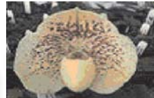
B-4 & B-14 Brachypetalum paphs. Like bellatulum