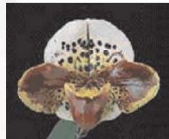
B 6 through 8 Complex paphs