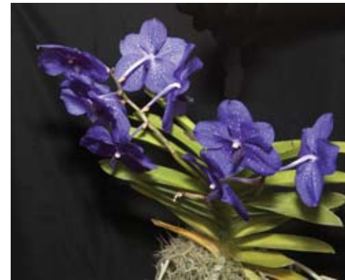
V. Pachara Delight 'Isabella'