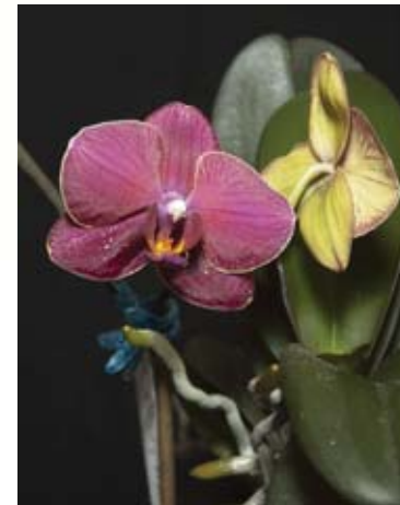
Phal. Bloody Mary