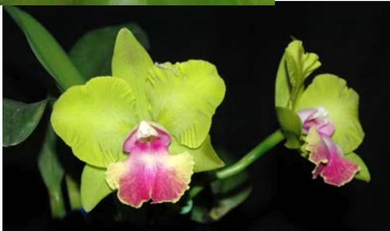
Blc. Crowfield 'Mendenhall' FCC