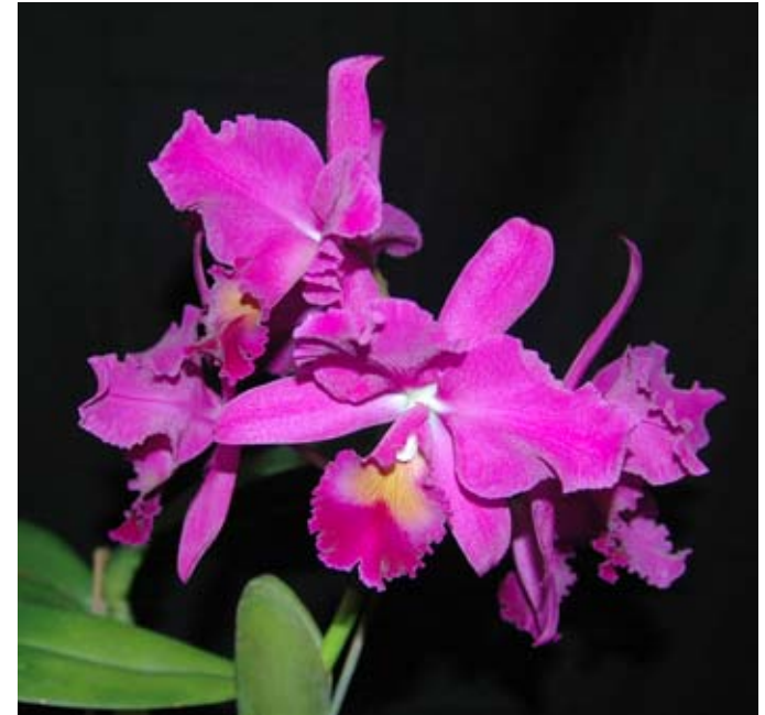
C. Genevieve 'Toy' x C. Portia