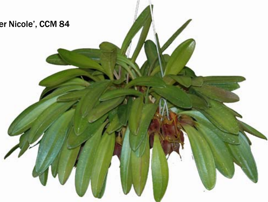
Masd. angulata 'Heather Nicole', CCM 84