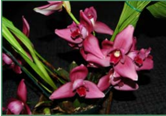
Lyc. Wyld Unicorn x (Malibu Canyon x Kowlina)