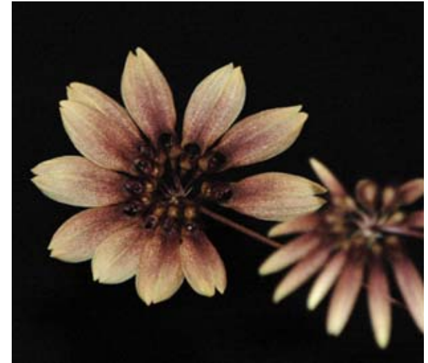
Cirr. Daisy Chain

California Sierra Nevada http://www.csnjc.org