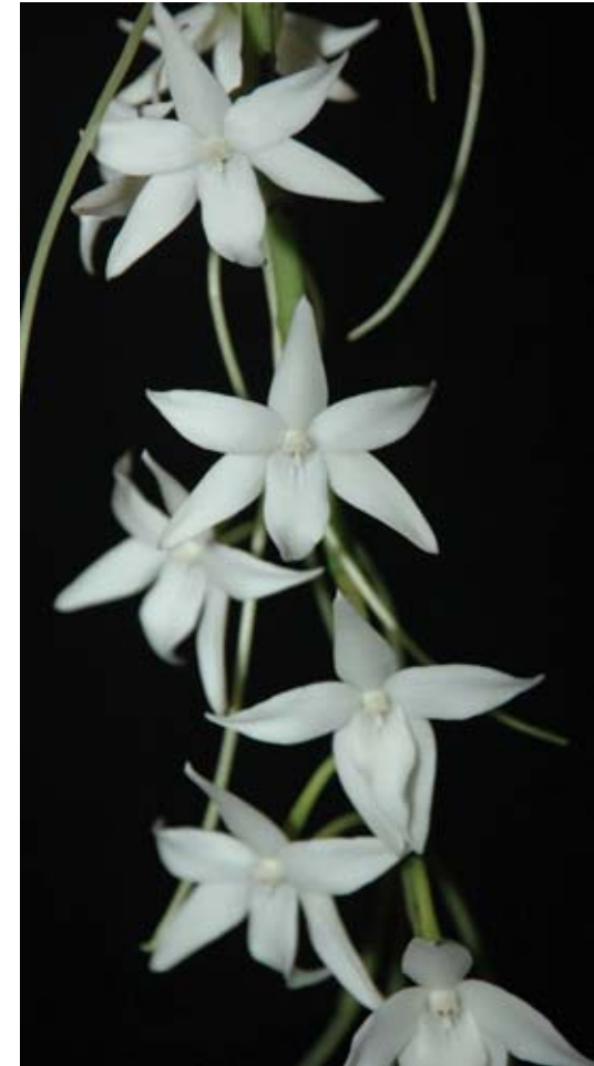
Aerangis citrata "Waterfield" HCC/AOS