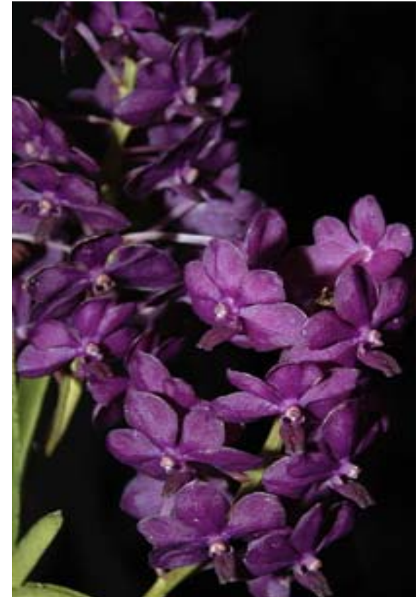
Vasco. Pine Rivers "Redland Sky" AM/AOS