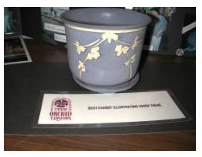
Best Exhibit Illustrating Show Theme