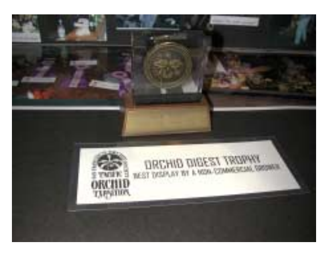
The Orchid Digest Award