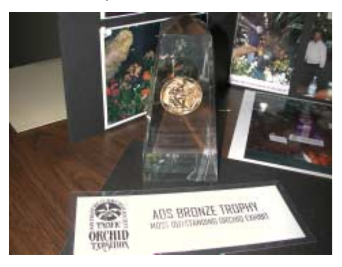
The AOS Bronze Trophy