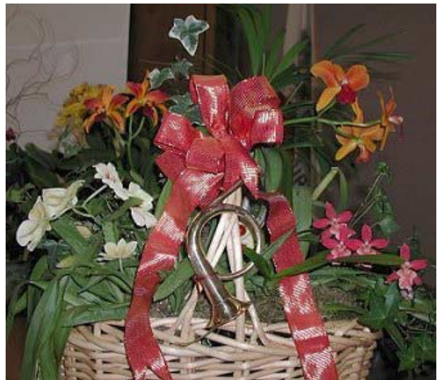
Best decorated display - Bill and Edie Morse