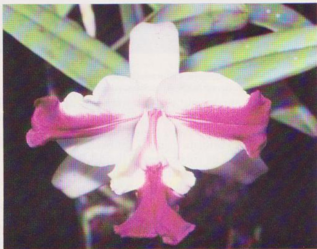
Cattleya intermedia var. aquinii 'Sao Paulo'

A LL THE WORLD LOVES A CLOWN! There is something immediately entertaining and acceptable to the entire world about a clown that breaks all barriers of language and culture. Only those possessing a uniqueness of character can truly qualify for this fascinating group, for a clown is called upon to be a comedian, tragedian, acrobat, juggler, mime, harlequin, fool, or, upon occasion, a dramatist. It requires dedicated talent to lose one's own identity and personality in the delightful make-believe world of clowns, who, through their dress, makeup and antics, capture the hearts of all who watch them.