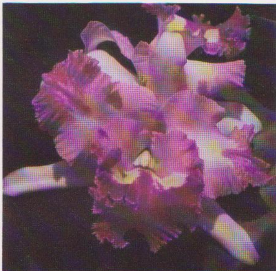
Brassocattleya Sonia Clark

While not everyone enjoys the clown of the circus, I think you will agree that they do have a universal appeal. It is my hope that the distinctive line of breeding involving Laeliocattleya Colorama 'The Clown' may bring pleasure and happiness to all who grow orchids by allowing them to lose themselves amongst the beauty found in these unusual color combinations.