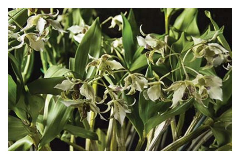
Den. Spider Lily

The third favorite orchid is Cochlioda noezliana . What makes this one of Cindy's favorite orchids is the vibrant tomato - orange color. The flowers exhibit multiple pigment layers. There are 6 to 25 flowers per inflorescence and each blossom is one to two inches in size. How do you make this plant happy? Grow it in