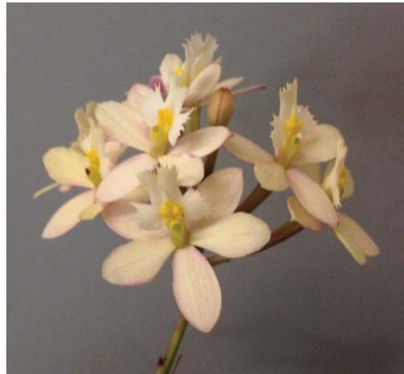
Epi Wedding Valle 'Yukima'