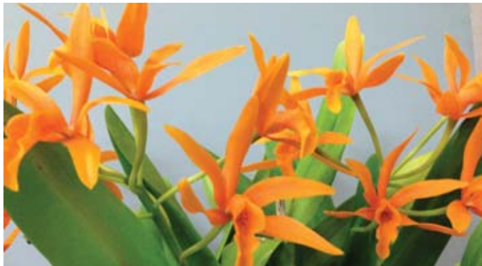
Ctt. Chit Chat