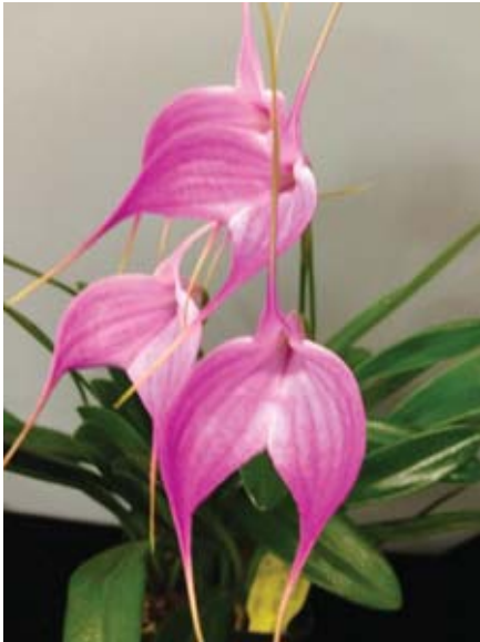
Masd. Bella Donna