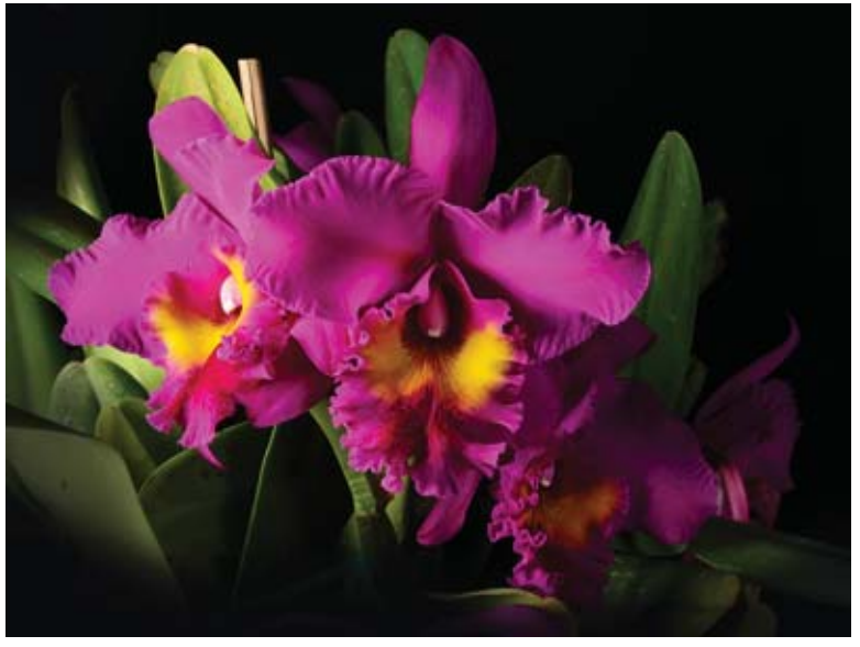
Rlc. King of Taiwan

REFRESHMENTS FOR THE JANUARY MEETING WILL BE PROVIDED BY THE BOARD