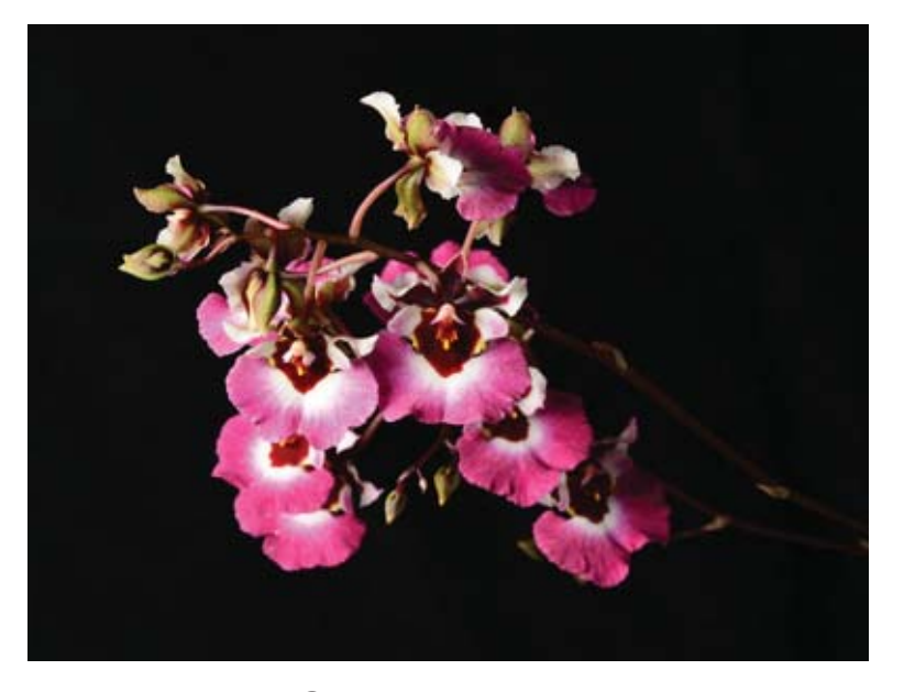
Tolu. Genting Pretty-n-Pink