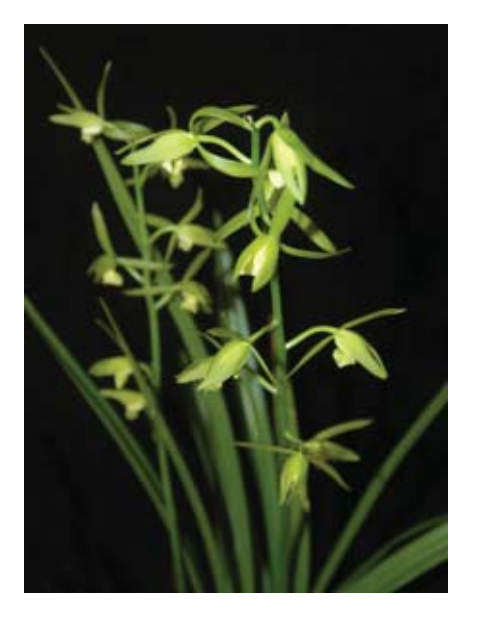
Cym. sinemse Valloum 'Roshan' MCC/AOS

Congratulations to everyone who's plant was awarded at POE Two members were recognized with "Best in Show" awards