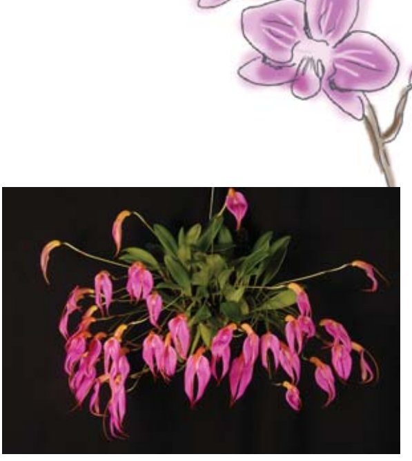
Masdevallia rosea 'Maya Maria' species CCM 85