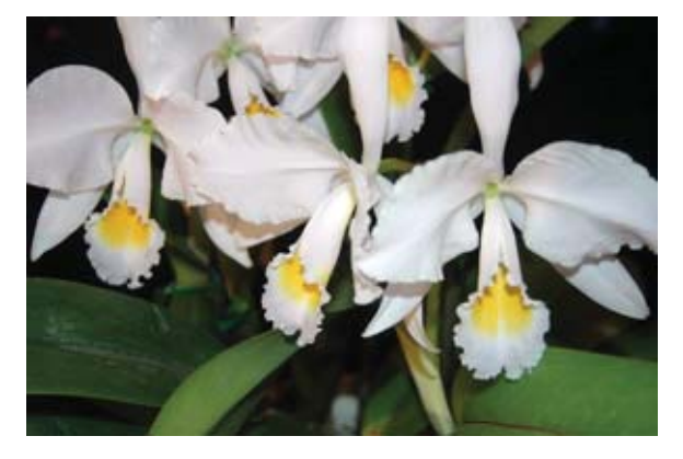
C. schroderae 'Will'