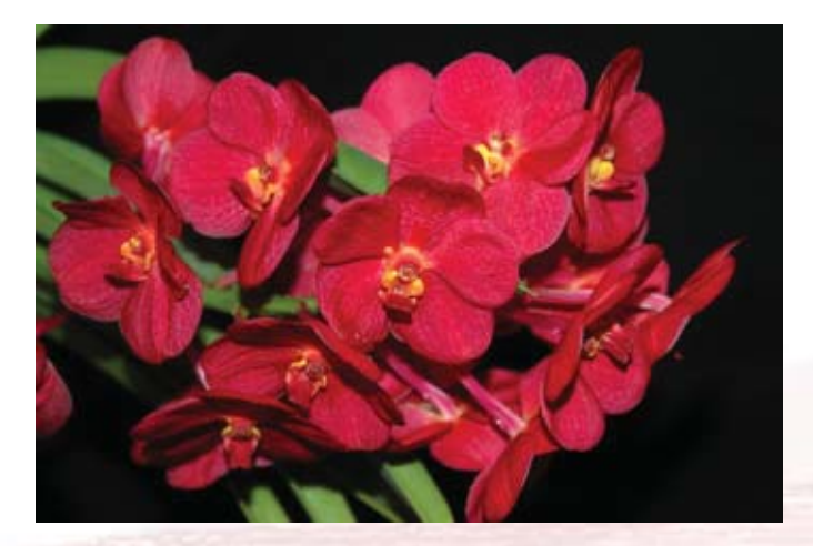
Ascda. Fuchs Royal Dragon

Sanguinea: means "blood" these are flowers even darker than Rubra