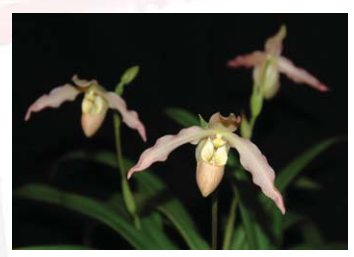
Phrag. Ice Princess

call as you are on the way. PLEASE the night before. This is because the Restaurant is closed for several hours during the day and they DO NOT listen to their messages if I call the day of and they have the answering machine on. AND it can be a modified chore for the VP, if anyone want to be a "hospitality" Chair. YOU have a free dinner and get to meet and chat before hand with very interesting people.