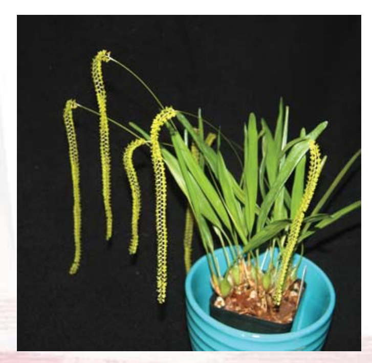
Ddc. filiforme 'Dolores'