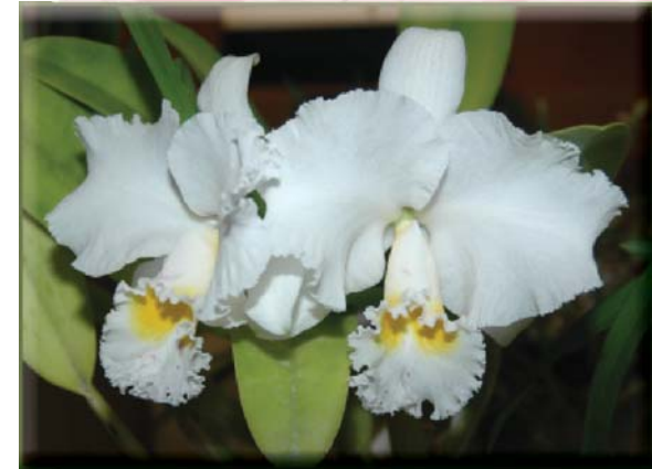
C. Earl 'Imperialis'