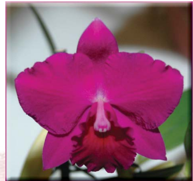
Slc. Purple Jewel