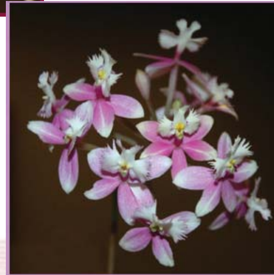
Epi. Wedding Valley

To add your needs to the order email or call Miki (contact info in your directory) before March 17