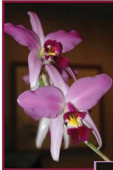
L. anceps 'GLW'

Back by popular demand: our April plant table will be a Grab Bag event.