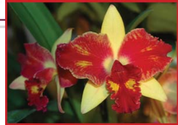
Slc. Fire Magic 'Solar Flare'

Be sure you have paid in order to have your name printed in our 2012 Roster