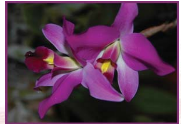
L. anceps v. guerrero 'Mendenhall'

Most orchids are epiphytes which means, in nature, they grow in the forest canopy without soil. They attach their roots to the tree for support only. How do they get nutrients when they are in the tree tops? It's not from a bird droppings. It's from the tree canopy. When the trees of the forest canopy grow they absorb nutrients through their roots and transport them to their leaves where they are used to photosynthesize. When it rains excess nutrients are leached out of the leaves of the tree and drip onto the orchids and thereby transfer the nutrients to the orchid plant for absorption.