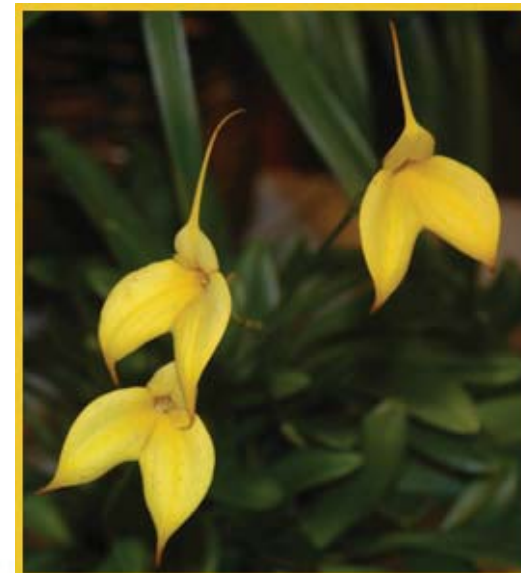
Masd. MacInnes 'Golden Heart'