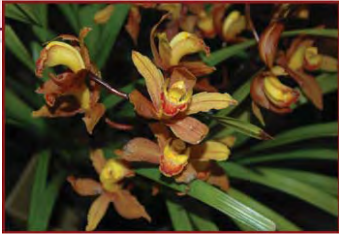
Cym. Mighty Sunset 'Roxborough'