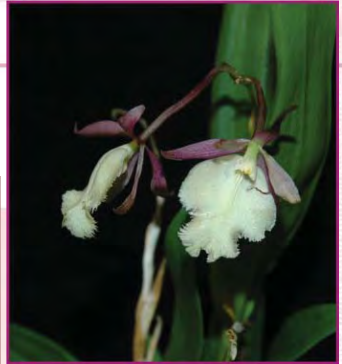
Epcl. Haiku Twinkle 'Red Elf'

Reminder: Your raffle ticket for bringing food is like two tickets. If you are not picked in the food drawing, your ticket goes into the bucket with the purchased tickets, giving you a second chance to win.