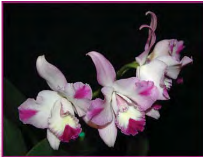
Lc. Angel Heart 'Hihimanu'

AOS would like to thank all of you for your patience and understanding during their move to the Fairchild Tropical Botanic Garden. The new phone and fax numbers have been installed and are: Phone: 305-740-2010; Fax: 305-740-2011.