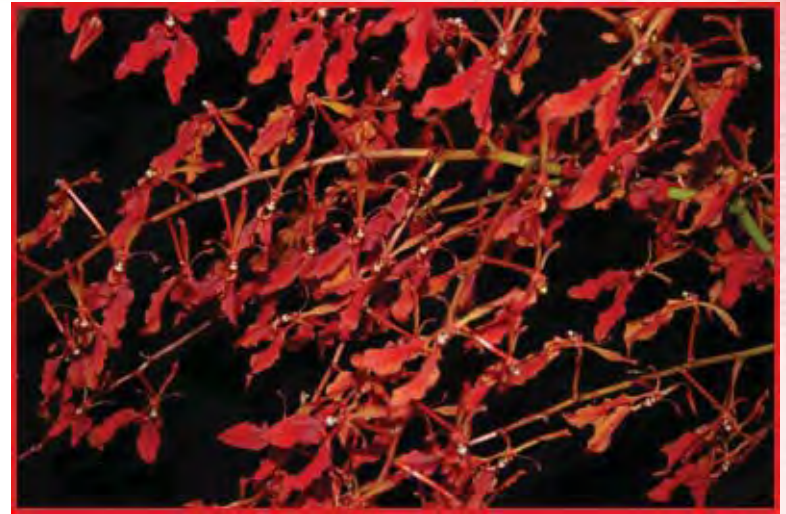
Renanthera imschootiana 'Pololei Lava Flow'