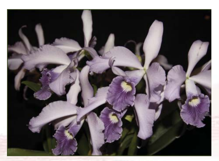
C. Canhamiana 'Azure Skies'