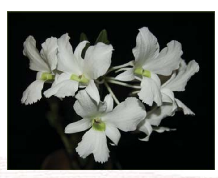
Den. sanderae v. luzonicum

Dinner with the Speakers will be at the Sichuan Fortune House in Pleasant Hill. This will be the only remuneration the speakers get. They have graciously donated the speaker's fee to the AOS for mailing the beginner's book 'Your First Orchid' which one receives as a benefit when one joins the AOS. I'll have AOS applications on hand, *G*.