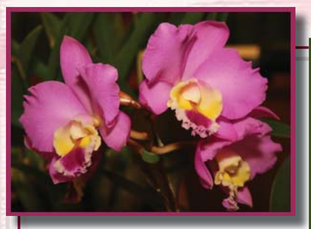
Slc. Samba Princess