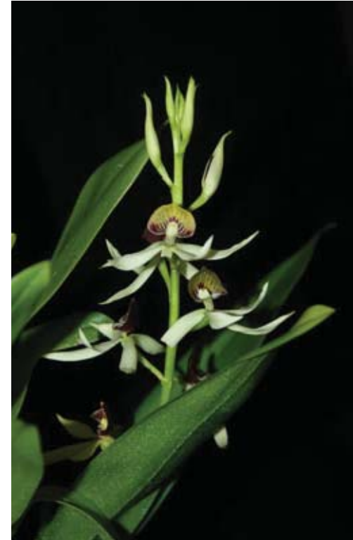
Prosthechea Green Hornet