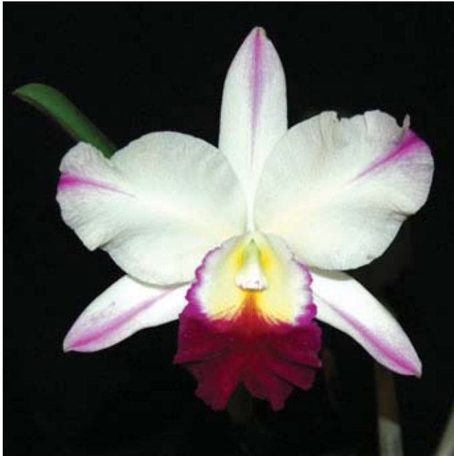
Rlc. Laura Bush 'Carmela'