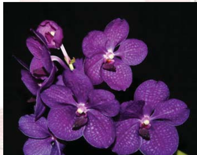
Vanda Pachara Delight

Our refreshment period is where we judge the "show and tell" plants and photograph the winners. Is 15 minutes enough for this? The folks cleaning up the refreshment room don't want to miss "show and tell" especially if they have brought plants. We have a substantial group of orchids most months. We don't have a cultural session like many clubs, so we combine culture with "show and tell". We could limit the number of plants a person brings in, or just talk about the winners. Of course, when you bring in a plant, it's nice to not be overlooked. Which gives around an hour for show and tell and the raffle. And take down and clean-up which should start at 9:45 at the latest to be completely out by 10pm.