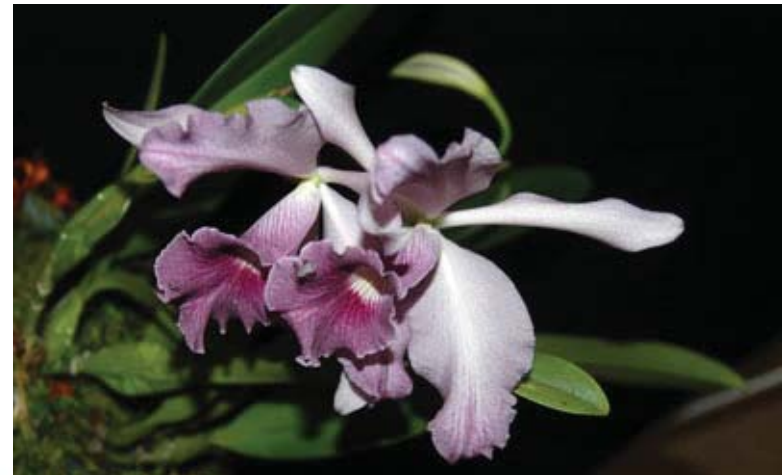
Lc. Canhamiana f. coerulea