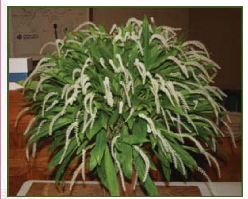
Den. glumaceum 'Vistamont'

There are several keys to success in growing these specimens. You need to be observant. Try to spend a few minutes with your plant everyday to look for potential issues. Optimize your cultural conditions, keeping written records if possible. Try to water the entire plant thoroughly. This means the leaves, roots, pot and or mount. Provide good air circulation to your plants. Always get the right size pot or mount for your plant before you begin. Err on the side of under-potting rather than over-potting. Choose a pot that will accommodate one year's growth, but choose a mount that can safely carry the plant for years. Use a potting mix that does not decompose quickly. If you use a plastic pot, your plant's roots will stay wetter than in a clay pot. A larger pot will always stay wetter at the center than a smaller pot. To alleviate this situation, place an inverted net pot in the bottom of your large pot