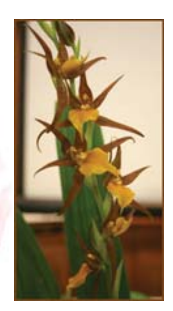
Adgm Summit 'Frenchtown'

Awards can be seen at: Pacific Central Judging Center <a href="www.aospacificcentral.org">www.aospacificcentral.org</a> California Sierra Nevada Judging Center: <a href="www.csnjc.org">www.csnjc.org</a> CSNJC on Facebook: <a href="http://www.facebook.com/#!/pages/California-Sierra-Nevada-Judging-Center/104769679585467">http://www.facebook.com/#!/pages/California-Sierra-Nevada-Judging-Center/104769679585467</a>