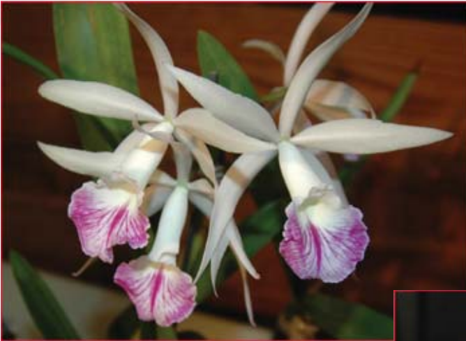
C. intermedia v. amethystina x Bl. Morning Glory 'Mary Putnam'