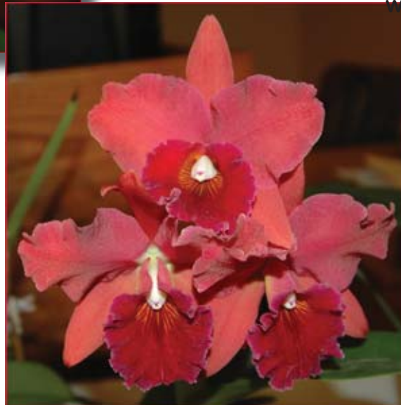
Pot. Mem. Mario Lanza #3 x Blc. Murray Spencer