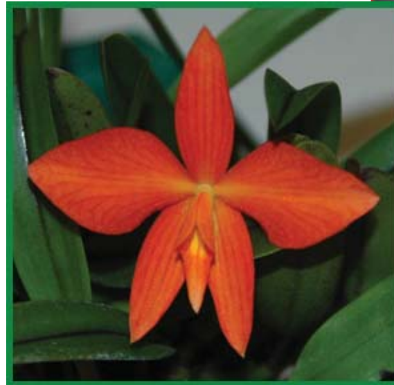
C. (Sophronitis) coccinea