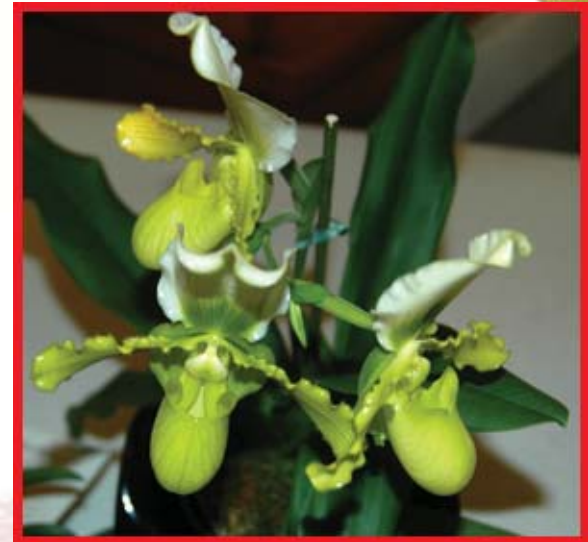
Paph. primulinum x Golden Liz