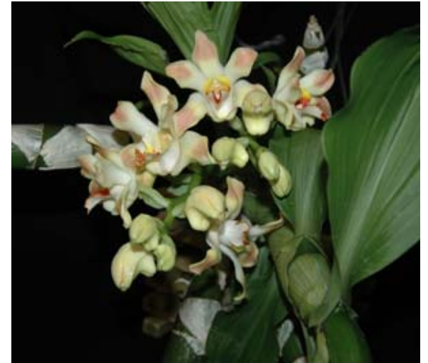
Chysis Langleyensis 'Golden Goliath'

These orchids do make fantastic hybrids when combined with Cycnoches . The cross imparts the best features of each species. The hybrid gets the size and shape from the Cycnoches and the more intense flower color and high flower count from the Mormodes . This hybrid also grows vigorously and can be a very awardable plant.