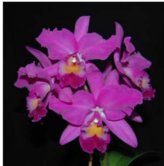
C. Genevieve 'Toy' x C. Portia