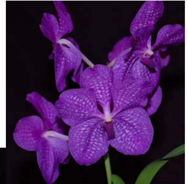
V. Sansai Blue 'Dr. Anek'

California Sierra Nevada Judging Center http://www.csnjc.org