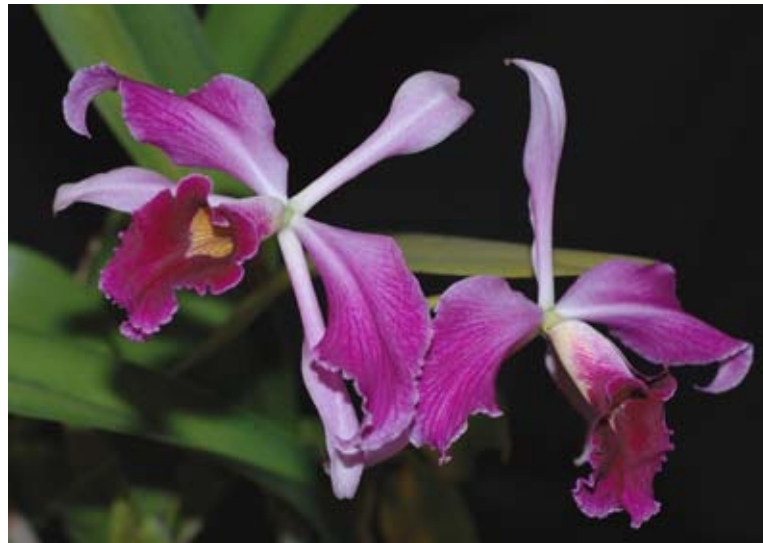
L. purpurata '#170' x L. purpurata v. flammea '#106'