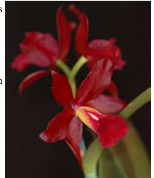
Slc. Tutakamen 'Pop'