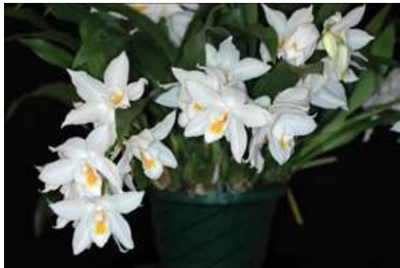
Coel. mooreana 'Brockhurst' FCC/ RHS

Masd. Monarch 'Highland Gold' AM/AOS x Masd. Highland Fling 'Pure Color'