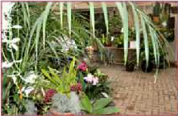
Alden Lane show and sale