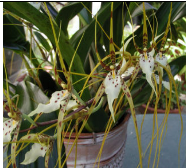
Brassia arcuigera 'Santa Barbara'