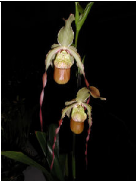
Phragmipedium Les Dirouilles