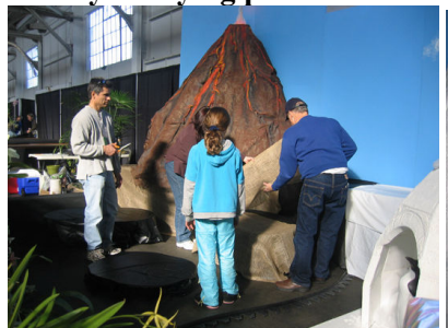
Putting display together