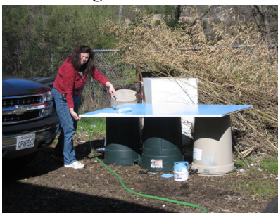
Linda painting panel