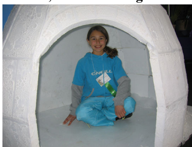
Our Show Mascot