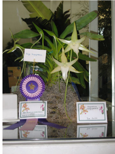
Joe Grillo's Angraecum Sesquipedale