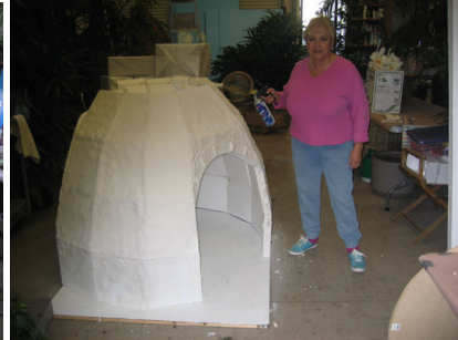
Spraying snow on Igloo