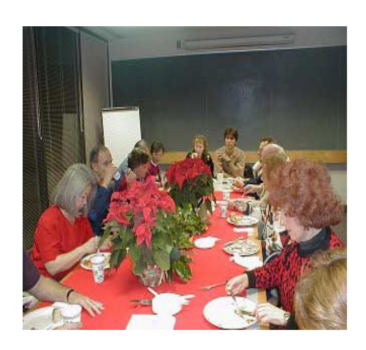
Lots of good eats!