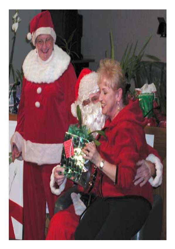
Are you sure you've been good?