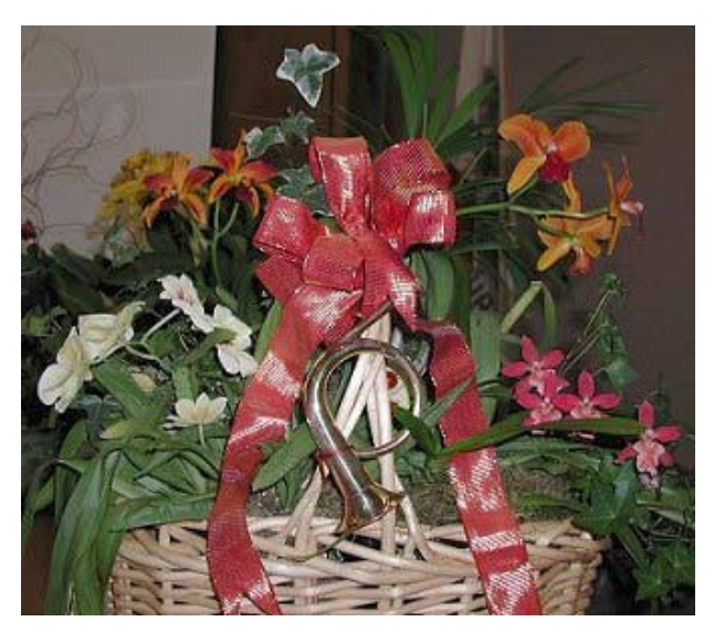
Best decorated display -Bill and Edie Morse