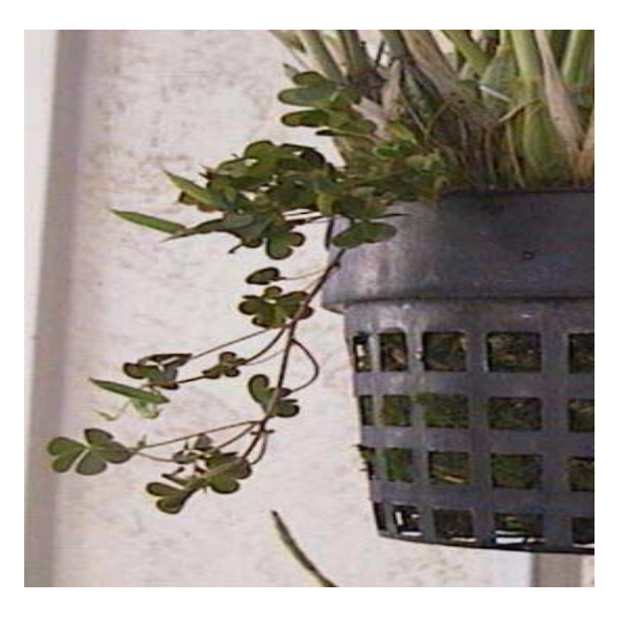
Oxalis before the Round-Up treatment