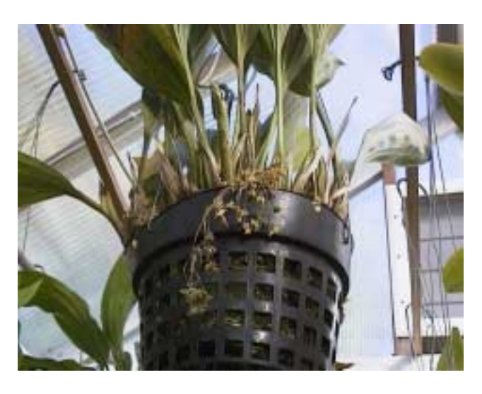
Oxalis after the Round-Up treatment - no more yucky Oxalis!